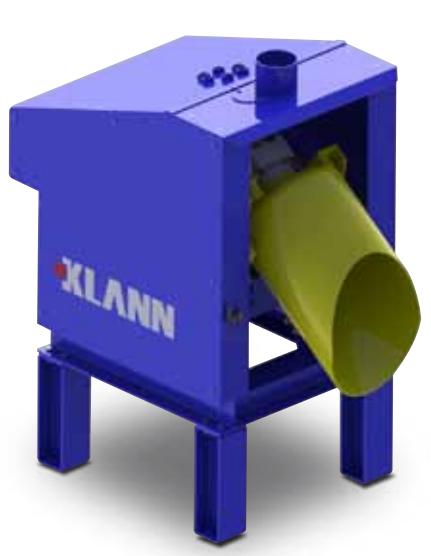
PKM mixer in discharge position

The sand feed can be dosed either by a volumetric dosing device or by a weighing device. The volumetric dosing device allows fixed half or full mixture loads. The weighing bin offers variable loads of different raw material and additives to a certain precision. These dosing devices are offered by KLANN as part of the core sand processing equipment.