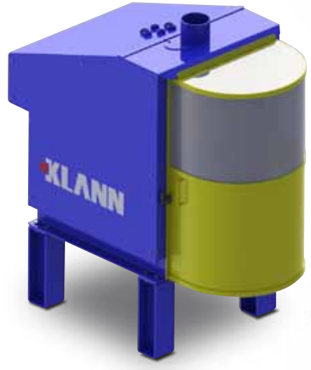
PKM mixer with front protection for separate installation